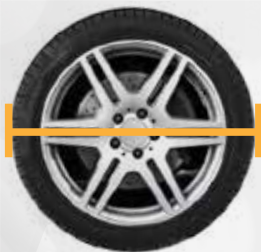
Maximum Wheel Width 43" (1100mm)