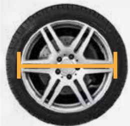
Rim Clamping 11" – 26" (279mm -610mm)