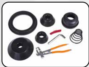
Accessory Kit including Wheel Width Calipers