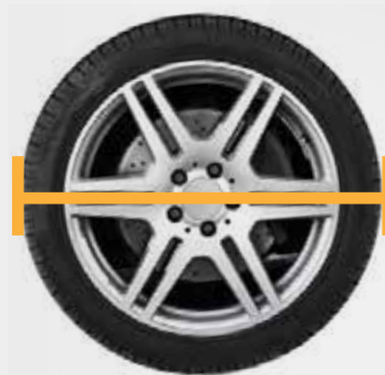
Tyre size up to 44"