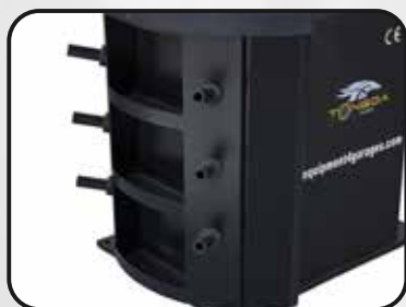
Storage for 4 cones