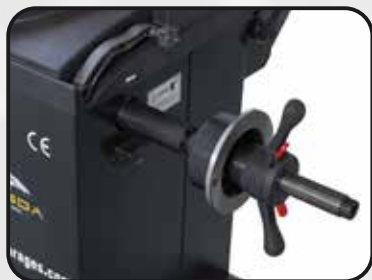
Wing Nut Kit