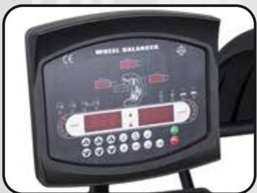
LED Monitor with 5 Displays