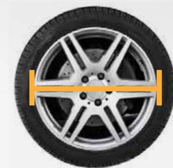
Rim Diameter 10"-24"