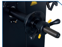
40mm Balancing Shaft