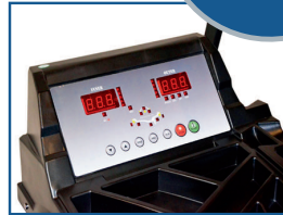
Simple Control Panel