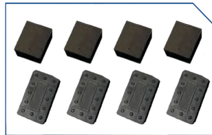
120 x 100 x 38mm and 120 x 100 x 70mm rubber blocks included.