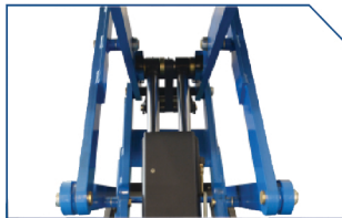
Dual synchronous hydraulic cylinders assure level lifting.