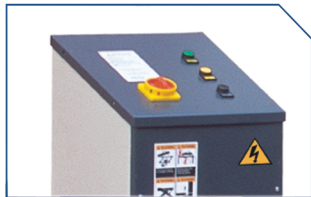
24V control cabinet.