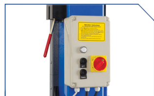
24V control system and single point safety release.