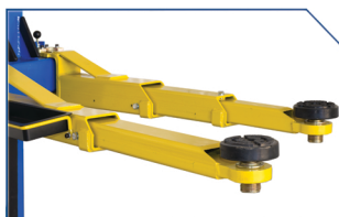
2 and 3 stage extension arms.