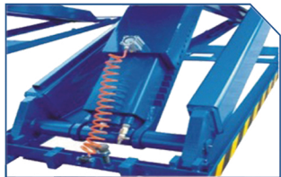
Electro-air safety device